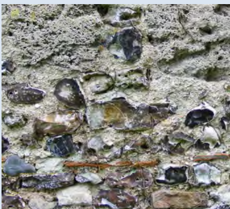
Rough field flints used in a wall at Marsh Benham.