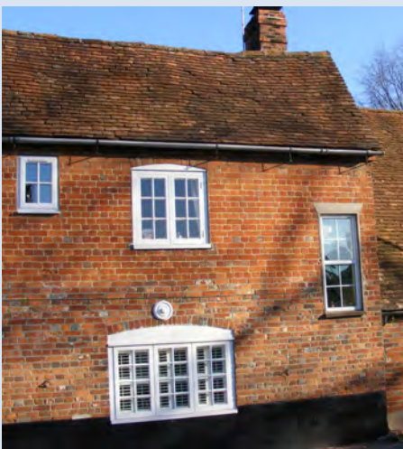
Typical red bricks and tiles made at Kintbury from local sands, clay and chalk.