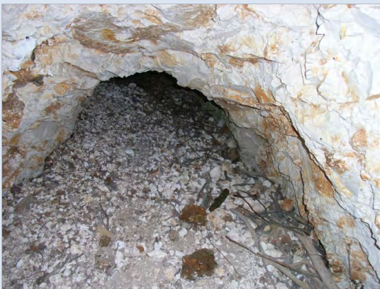
Entrance to chalk mine at Yattendon