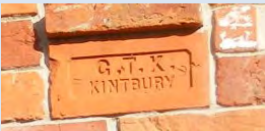
Brick from Kintbury