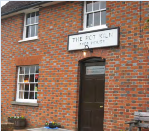
The Pot Kiln at Frilsham. There was a kiln here where bricks were made from nearby sands and clays and chalk from the valley.